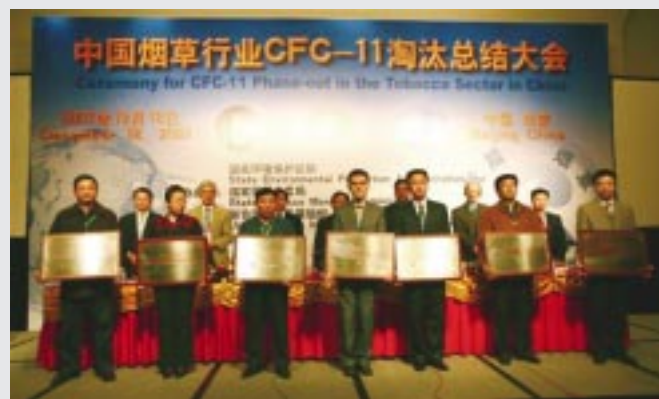
Awarding Ceremony for contributions to CFC-11 phaseout in tobacco sector.