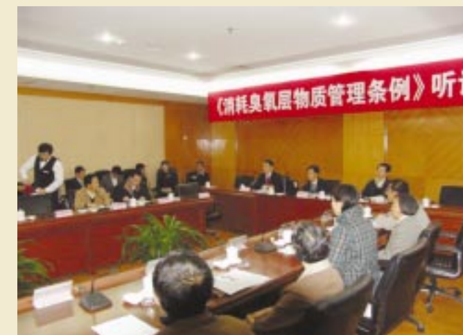
Hearing convened in Beijing on Ordinance for ODS Management.

convened under the suggestion raised by the Legislation Office of the State Council. SEPA committed to submit the comments collected at the hearing to the Legislation Office and would seriously study on the comments and suggestions for further improving the draft ordinance.