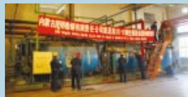
The CFC-11 tobacco expansion unit in Kunming Cigarette Co. Ltd in Inner Mongolia is being dismantled.