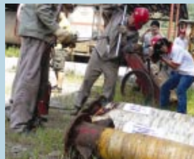
The last CFCs production lines are being dismantled.