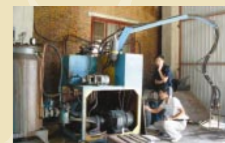
Experts visit foam enterprises.