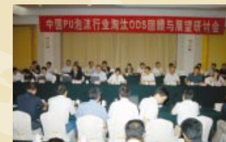
Workshop for review and prospect of ODS phaseout in PU foam sector in China.