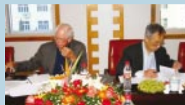
Experts from World Bank visit CFCs plants in China.