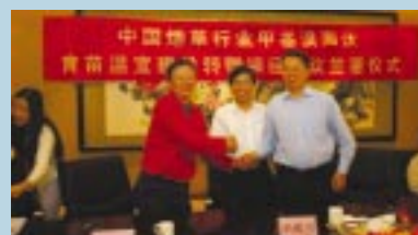
Contract signing ceremony for construction of seedling greenhouses for MBr phaseout in the tobacco sector.