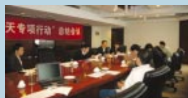
Meeting convened for concluding Action of "Sky Hole Patching Initiative".